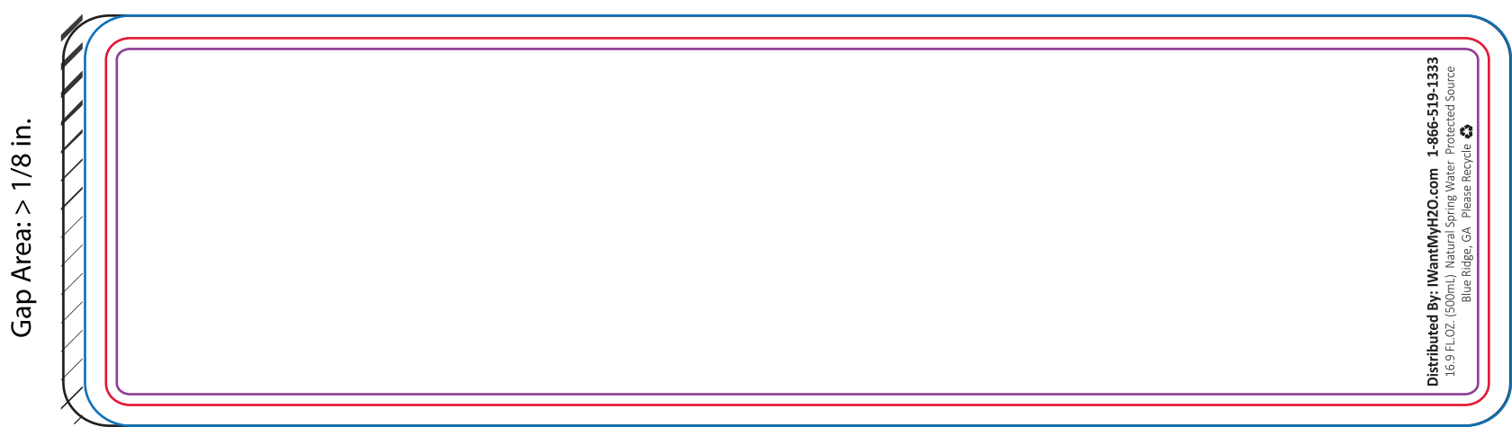
16.9oz Bottle - ( 8.25" x 2.38" )