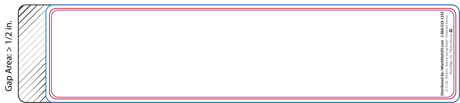
12oz Bottle - ( 7.375" x 1.75" )