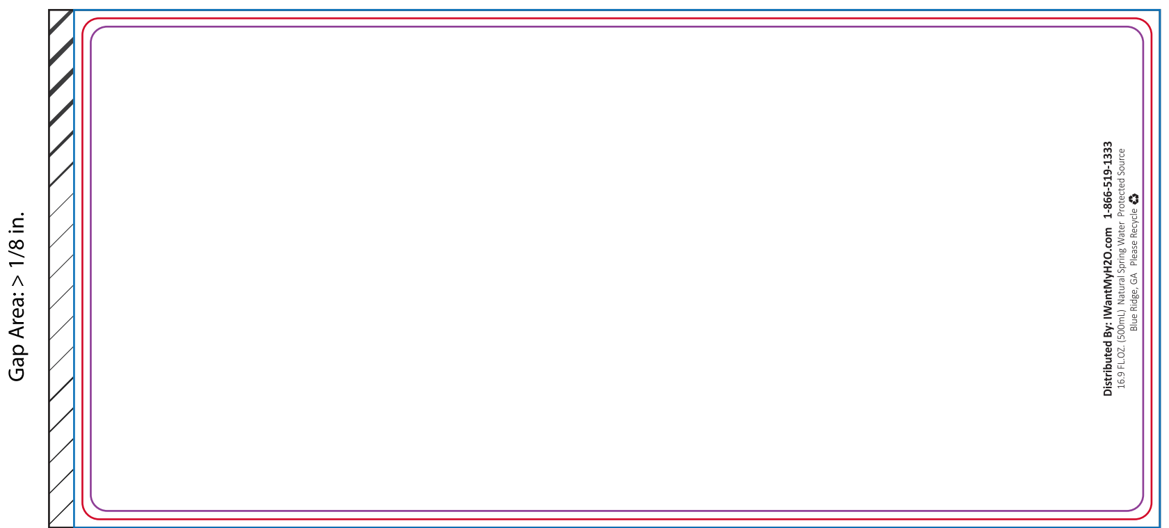
16.9oz Bottle - ( 8.125" x 3.875" )